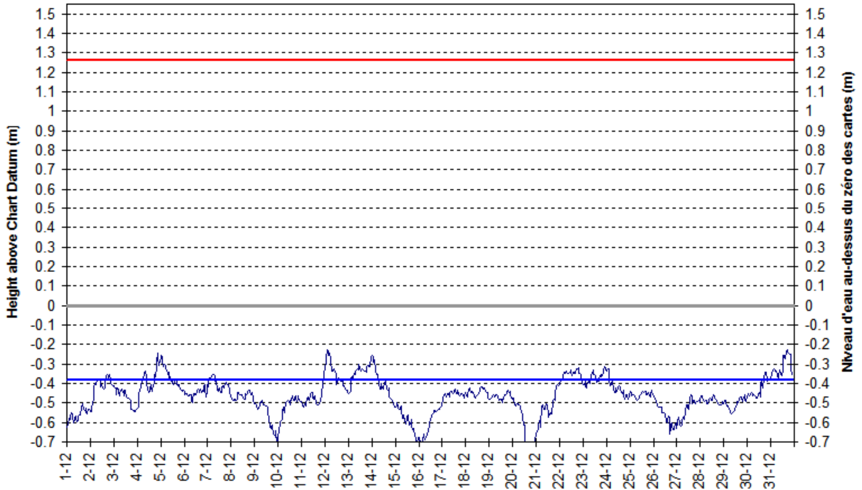
Chart Datum is 176.0 metres above IGLD 1985 / Zéro des cartes est 176.0 m au-dessus du S.R.I.G.L. 1985

* monthly mean for Lake Huron / moyenne mensuelle du Lac Huron